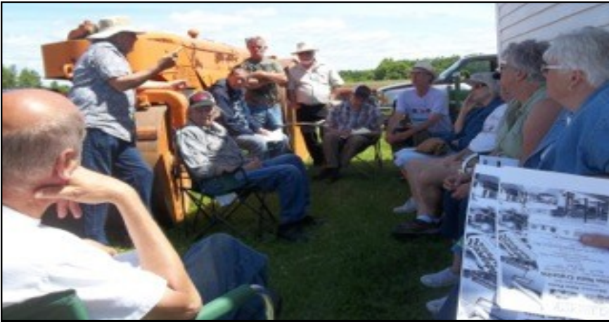
Our June meeting in Madrid