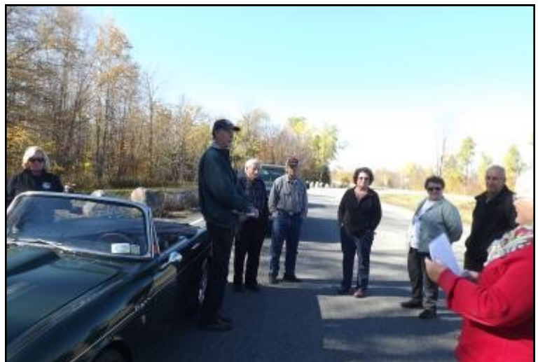
Meeting up half way for a rest during our mystery cruise