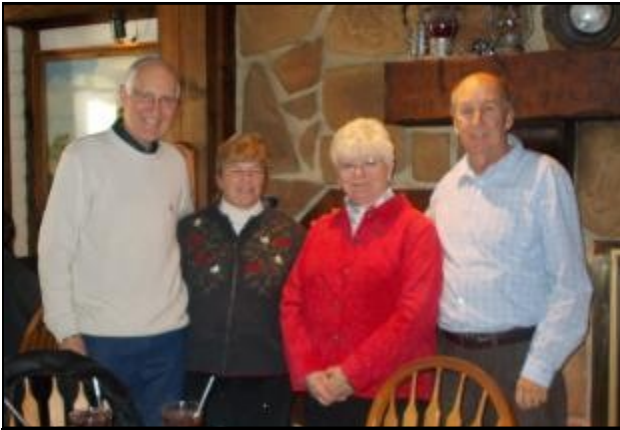
Scenes from the Christmas party at The Freight House